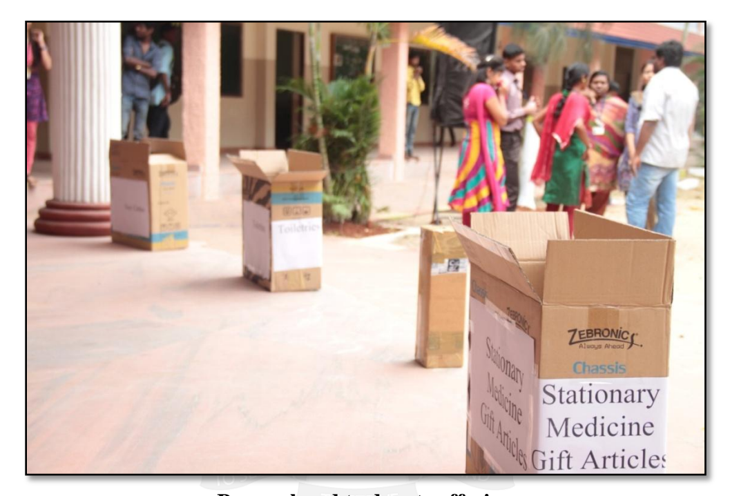
Boxes placed to donate offerings

Care and Share, a communal Christmas programme was celebrated by inviting the NGO's from across the city. Each department identified an NGO and provided them with necessary utility items.