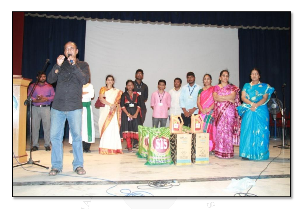
Offerings were placed for donation