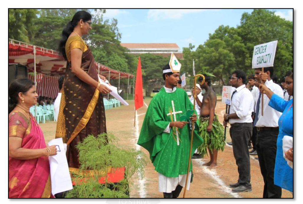
Students with the placard on Gender Equity

The members of the AICUF unit participated in the Annual Sports Meet March past on the theme "Social Awareness" with the view to "Change to Change the World". The contingent marched with placards representing the diverse causes of society such as Gender Equality, Save the Girl Child, and Religious Harmony.