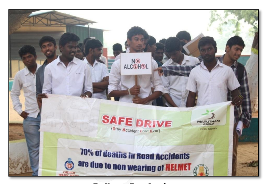
Rally on Road safety

A rally to create awareness on road safety was organized on 17<sup>th</sup> January 2015 as part of Road Safety week. Teachers and club volunteers walked from Kotturpuram to Malar Hospital, Adyar with banners and distributing pamphlets. Around ninety student volunteers participated in the rally. To convey the message of road safety through strong visual impact the club volunteers also enacted a street play on the main road which was very well received.